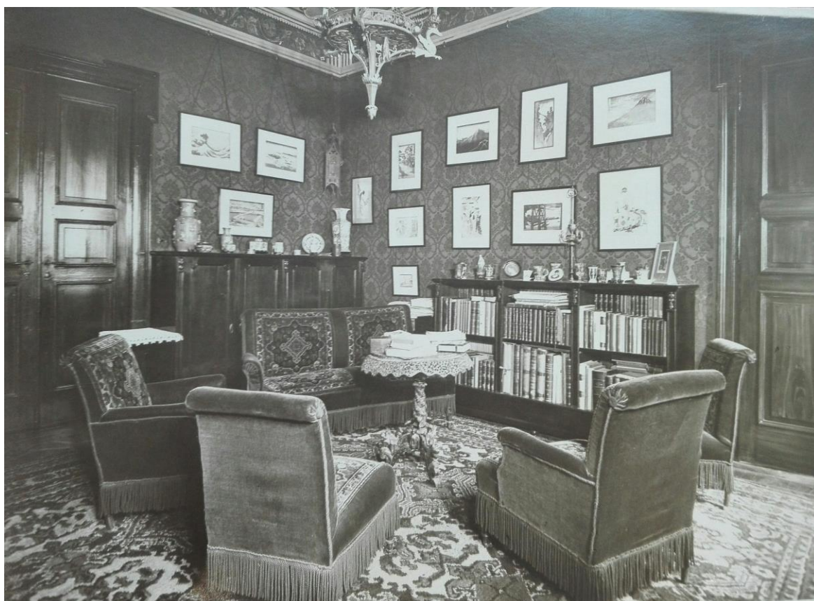
Fig. 2: Studio with Japanese prints, Palazzo Morpurgo, Fototeca, Civici Musei di Storia ed Arte, Trieste, inv. 33177