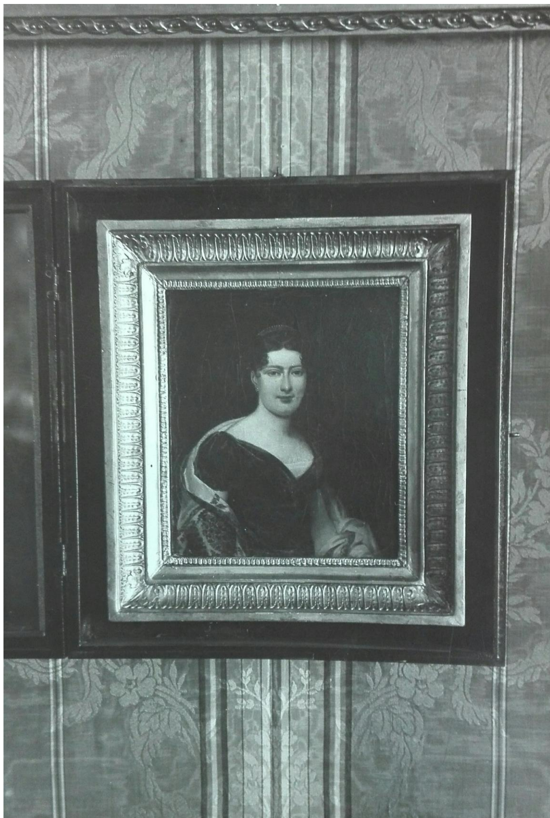
Fig. 3: Jean-Auguste-Dominique Ingres (attributed), Female portrait , Palazzo Morpurgo, Fototeca, Civici Musei di Storia ed Arte, Trieste, inv. 33193